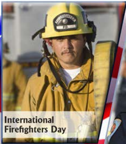
International Firefighters Day