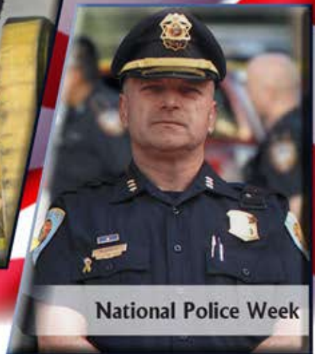
National Police Week